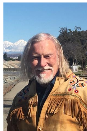
Peter McLaren *

Keywords: Revolutionary Critical Pedagogy; Paulo Freire; Pandemic; Worker Cooperative; Knowledge Capitalism