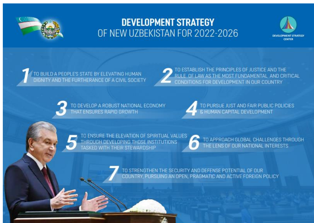
Figure 1. Development Strategy of New Uzbekistan for 2022-2026 (Source: Development Strategy Center)

easier to control efficiency and effectiveness. In other words, the government introduced a system of evaluating the effectiveness of planned reforms following the level of achievement of development goals. (p. 2)