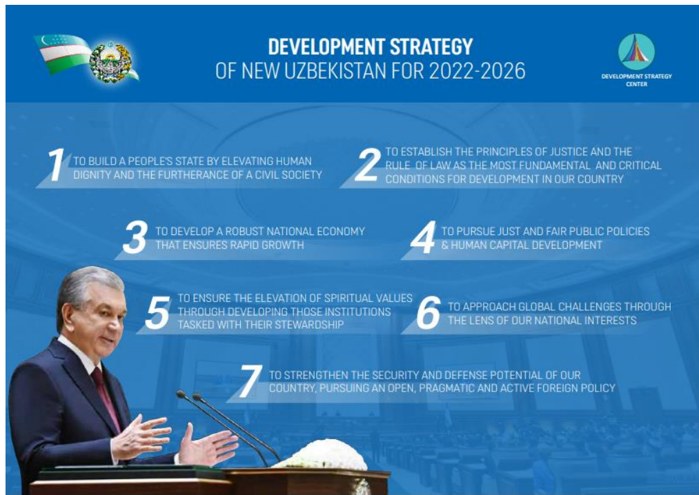
Figure 1. Development Strategy of New Uzbekistan for 2022-2026 (Source: Development Strategy Center)

easier to control efficiency and effectiveness. In other words, the government introduced a system of evaluating the effectiveness of planned reforms following the level of achievement of development goals. (p. 2)