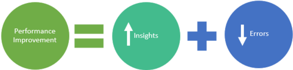
Figure 2. Adapted from Klein’s (2017) Performance Improvement Model

For school leaders to improve the performance of their school, they might find that they not only need to eliminate or reduce the errors in their decisions, but also increase their insights. In other words, relying on patterns that they draw upon to make rapid decisions do not have lasting effects, because each situation calls for a different solution. It is not one size fits all.