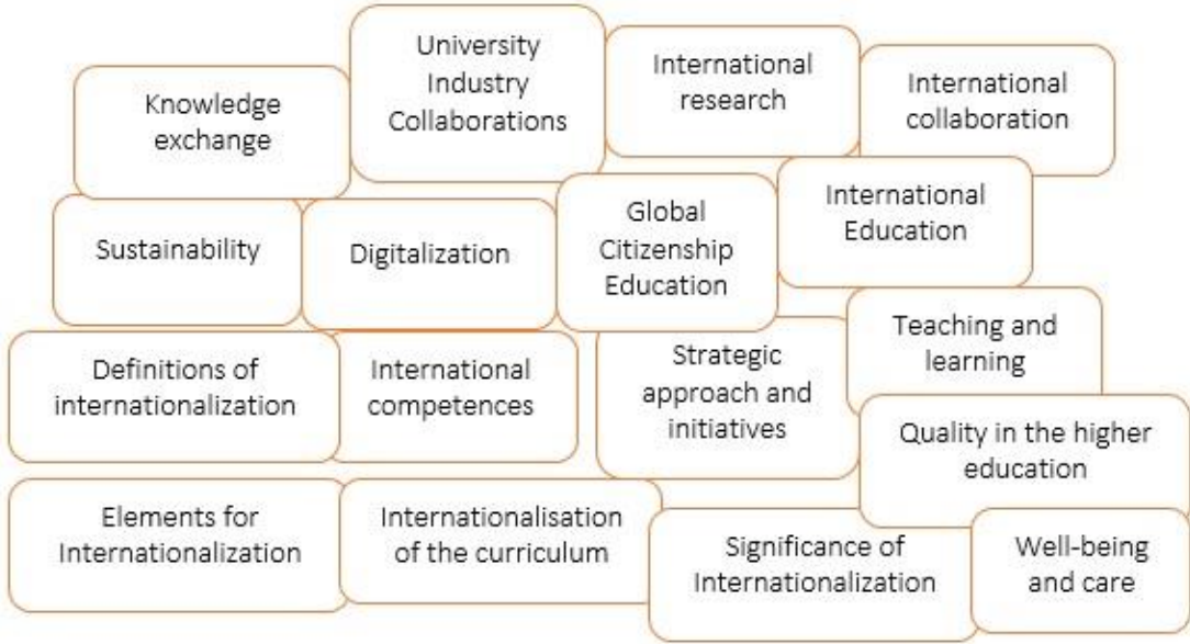
Figure 1. A thematic exploratory content analysis approach

We addressed our research questions through qualitative analysis, using qualitative data. A systematic review of literature was done through electronic search. The review was done with most articles from online databases, namely Taylor & Francis, Sage, Emerald, and Elsevier. The search approach concentrates on the keywords chosen such “internationalization”, “quality assurance”, and “transnational education”. The search locations were titles, abstracts, and keywords. After reviewing the 438 articles published between 2012 and 2024 in the systematic literature mapping, a deeper analysis was conducted for each of the 92 articles included in this review study. The inclusion criteria comprised peer-reviewed publications written in the English language. The collected and classified information and knowledge was then interpreted. This theoretical review used a grounded theory approach and a thematic exploratory content analysis approach as seen in Figure 1.