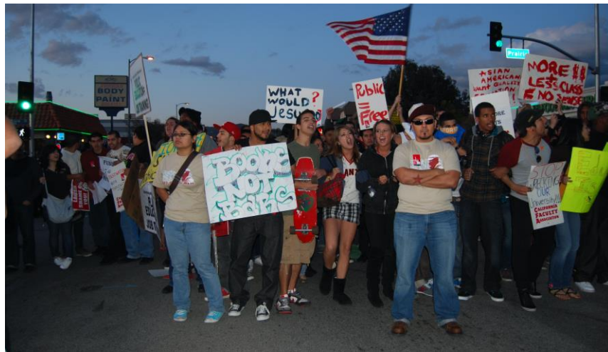
Figure 2. CSUN students protesting tuition hikes take over city streets, 2010. This protest movement launched the creation of CDSC.

In addition, CDSC's affiliated and allied faculty from various departments and divisions reflect the diversity of Los Angeles County and CSUN's increasingly diverse faculty. Over the last several years, newly appointed underrepresented and minoritized tenure-track faculty have joined CDSC from across campus including departments of Sociology, Communication Studies, Gender and Women Studies, Chicana/o Studies, Deaf Studies, Journalism, Africana Studies, and Asian American Studies. As CDSC programming continues to grow, CDSC plans to formalize its relationship with the university by becoming a teaching and learning center that will host its own research agenda. Interdisciplinary CDSC faculty leaders have carried out their work with the support of various CSUN campus entities, in particular the Office of the Provost and, most recently, the Office of the President's Commission on Diversity and Inclusion. After the 2021 appointment of a new university president who is a vocal advocate for diversity, equity, and inclusion (DEI), CDSC faculty leaders have strategically aligned their initiative with the university's DEI efforts to secure organizational legitimacy and institutional resources in order to advance CDSC's agenda.