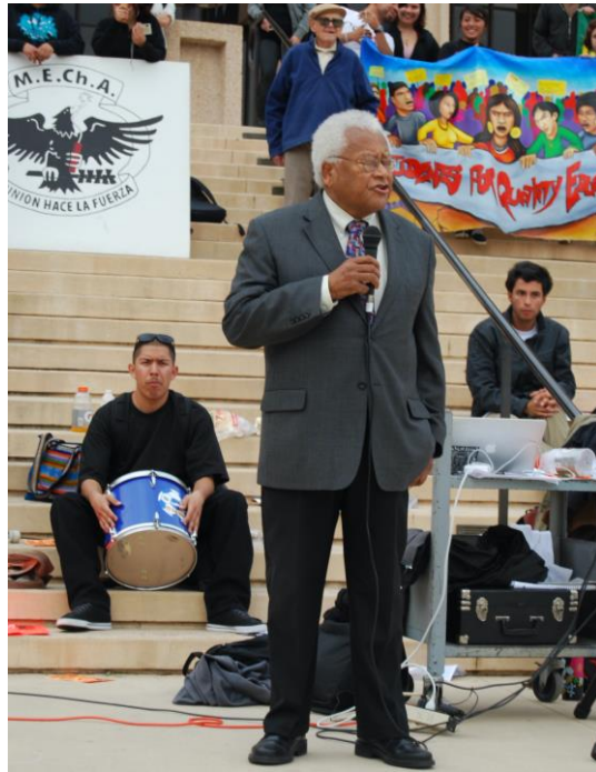
Figure 4. Civil rights leader Rev. Lawson Jr. facilitating a nonviolent resistance workshop for CSUN students in front of the university library, 2011.