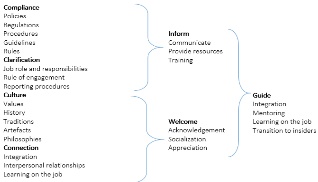
Figure 1. The alignment of the Four C’s and the IWG models (adopted from Bauer (2010); Klein & Heuser (2008))

Several onboarding models address what organisations do or should do to implement successful onboarding. The best known, empirically tested, and influential models are the Inform-Welcome-Guide (IWG) model (Klein & Heuser, 2008), the Four C’s (inter-related four components, such as compliance, clarification, culture, and connection) model (Bauer, 2010), and the socialisation tactics model (Van Maanen & Schein, 1979). The IWG model includes three categories: Inform (communicate to newcomers, provide them with resources and training), Welcome (welcoming newcomers, e.g., through a morning tea with senior colleagues, facilitating their socialization in the organisation) and Guide (assist newcomers with transitioning from outsider to insider through mentoring them or allocating them a buddy who guides newcomers into their new experiences). Figure 1 below presents the alignment of both these onboarding models.