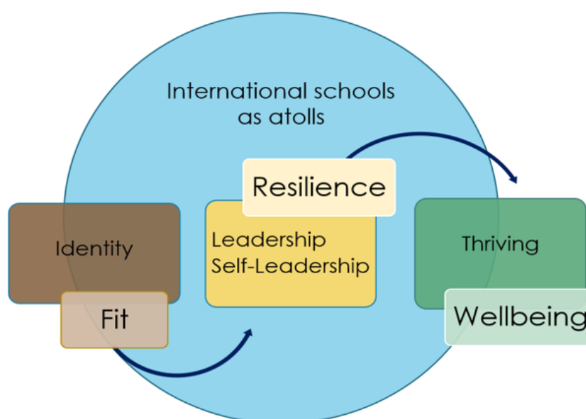
Figure 1. Educator Acculturation Framework (Developed by the author)