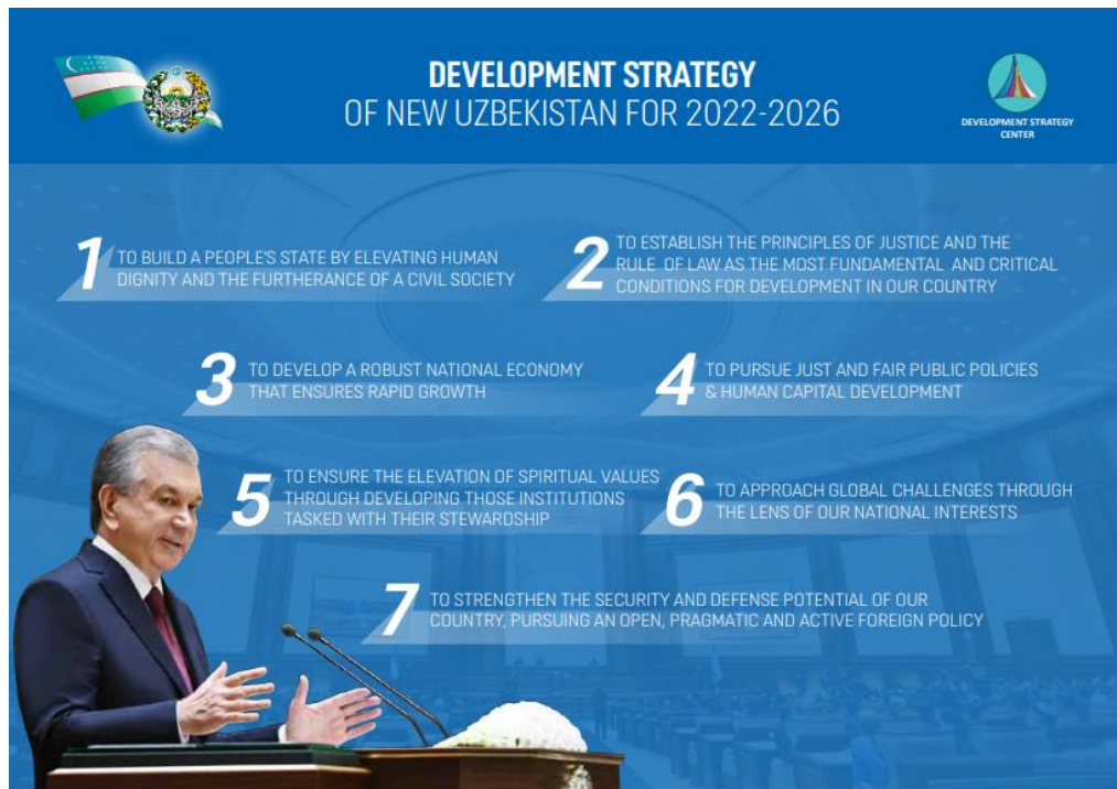
Figure 1. Development Strategy of New Uzbekistan for 2022-2026

easier to control efficiency and effectiveness. In other words, the government introduced a system of evaluating the effectiveness of planned reforms following the level of achievement of development goals. (p. 2)