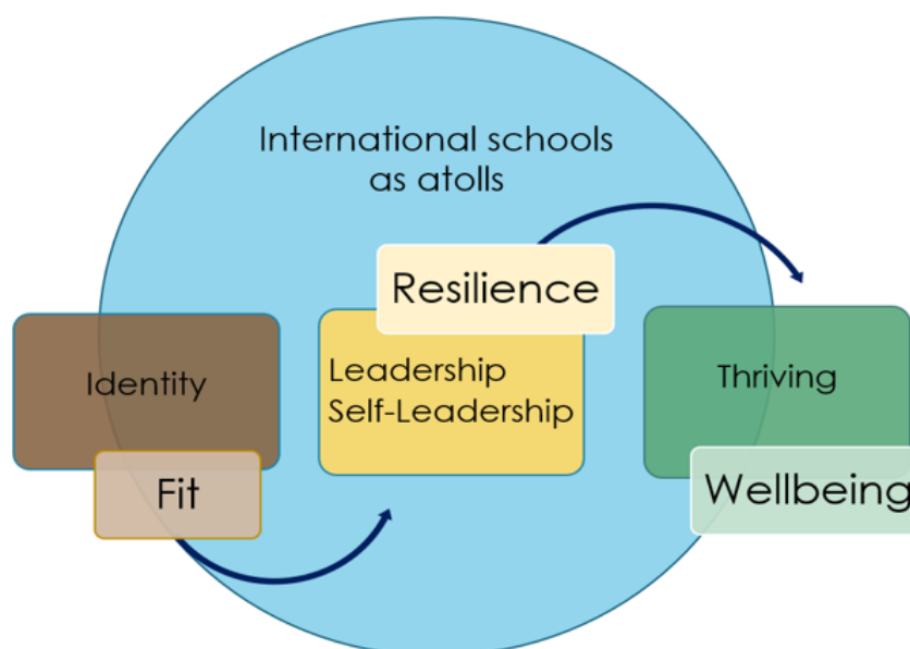
Figure 1. Educator Acculturation Framework (Developed by the author)