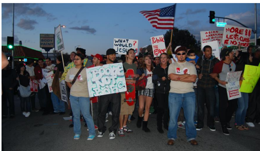
Figure 2. CSUN students protesting tuition hikes take over city streets, 2010. This protest movement launched the creation of CDSC.

In addition, CDSC's affiliated and allied faculty from various departments and divisions reflect the diversity of Los Angeles County and CSUN's increasingly diverse faculty. Over the last several years, newly appointed underrepresented and minoritized tenure-track faculty have joined CDSC from across campus including departments of Sociology, Communication Studies, Gender and Women Studies, Chicana/o Studies, Deaf Studies, Journalism, Africana Studies, and Asian American Studies. As CDSC programming continues to grow, CDSC plans to formalize its relationship with the university by becoming a teaching and learning center that will host its own research agenda. Interdisciplinary CDSC faculty leaders have carried out their work with the support of various CSUN campus entities, in particular the Office of the Provost and, most recently, the Office of the President's Commission on Diversity and Inclusion. After the 2021 appointment of a new university president who is a vocal advocate for diversity, equity, and inclusion (DEI), CDSC faculty leaders have strategically aligned their initiative with the university's DEI efforts to secure organizational legitimacy and institutional resources in order to advance CDSC's agenda.