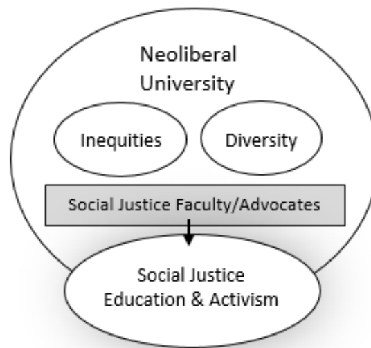
Figure 1. Faculty-led social justice efforts in the neoliberal university