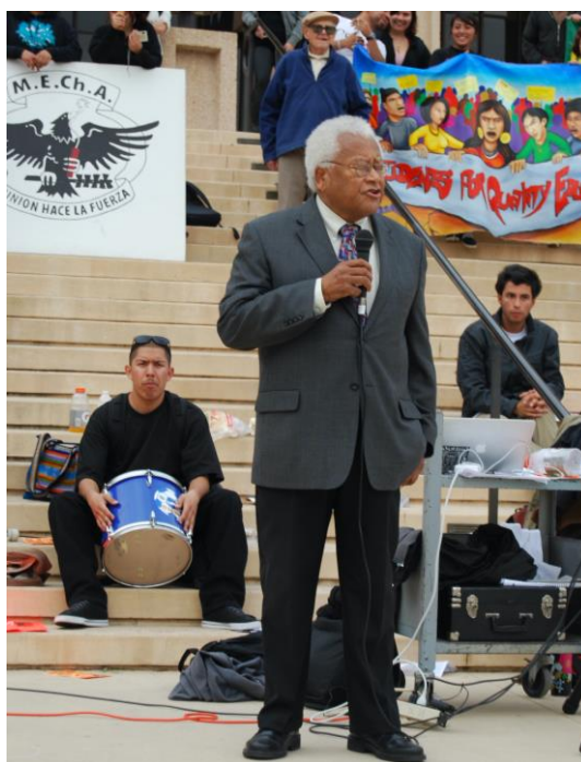
Figure 4. Civil rights leader Rev. Lawson Jr. facilitating a nonviolent resistance workshop for CSUN students in front of the university library, 2011.