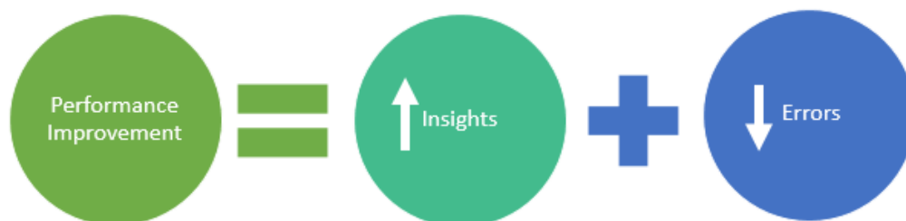
Figure 2. Adapted from Klein’s (2017) Performance Improvement Model

For school leaders to improve the performance of their school, they might find that they not only need to eliminate or reduce the errors in their decisions, but also increase their insights. In other words, relying on patterns that they draw upon to make rapid decisions do not have lasting effects, because each situation calls for a different solution. It is not one size fits all.