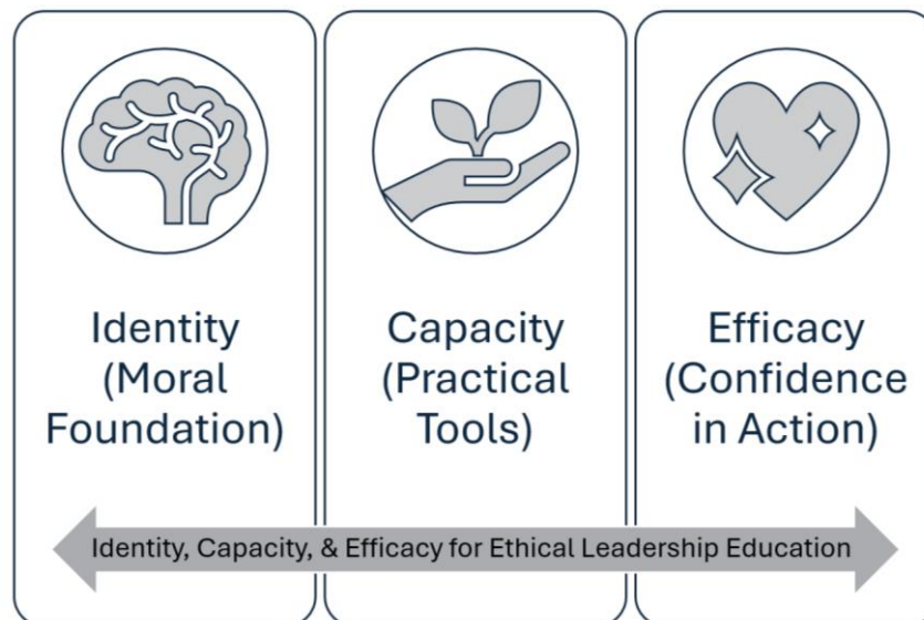
Figure 1. Identity, Capacity, & Efficacy for Ethical Leadership Education

Ethical leadership education aims to integrate identity, capacity, and efficacy into a cohesive framework for leadership development. This holistic approach ensures leaders are both grounded in strong ethical principles and equipped with the skills and confidence necessary to lead ethically in their organizations. The integration of these elements fosters a comprehensive model of ethical leadership where leaders are self-aware, competent, and confident in their ability to make ethical decisions and influence others positively (as seen in Figure 1).